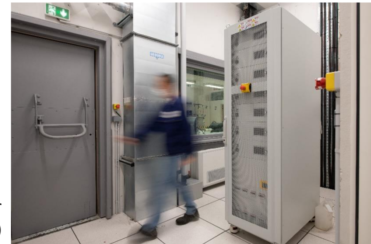
Electric power cabinet (210 kW)