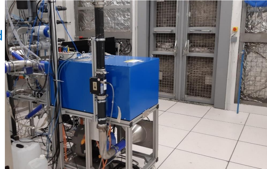
Test cell with fuse walls